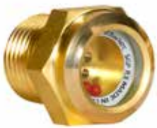
Figure 5: Sight glasses help determine quality of refrigerant and often include a moisture indicator. Ball valves are used to isolate refrigerant before servicing.

But without the right components in place to facilitate efficient inspection and maintenance routines, service engineer visits can take significantly longer than desired.