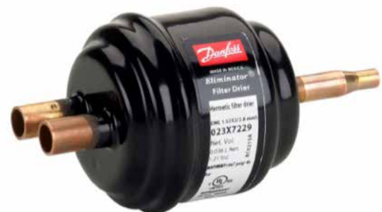
Figure 4: DCL/DML hermetic filter driers are 100% factory leak tested for high system reliability.

In addition, filter driers lower the moisture level in the refrigeration system to a safe design level, which stops corrosive acid from accumulating, and prevents icing.