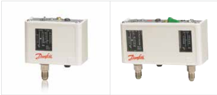
Figure 2. Danfoss KP/KPU switches are designed to protect systems from excessively high discharge and low suction pressures.

It not only makes our components compliant with evolving regulations but also provides peace of mind for manufacturers and operators by knowing their components are recognized by an international safety body.